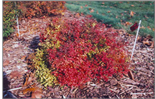
Dakota Goldcharm Spirea in fall

This shrub should only be grown in full sunlight. It prefers to grow in average to moist conditions, and shouldn't be allowed to dry out. It is not particular as to soil type or pH. It is highly tolerant of urban pollution and will even thrive in inner city environments. This is a selected variety of a species not originally from North America.