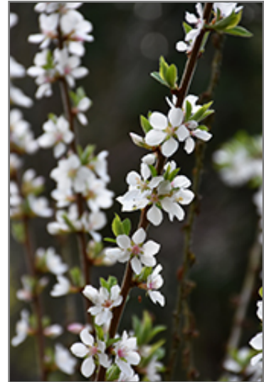
Japanese Bush Cherry flowers

Japanese Bush Cherry is recommended for the following landscape applications;