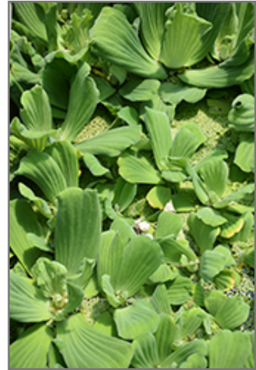
Water Lettuce foliage