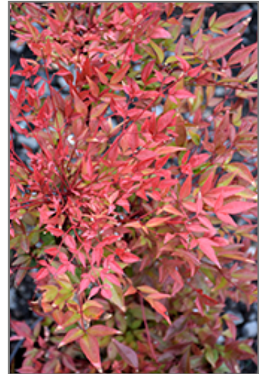
Obsession Nandina foliage