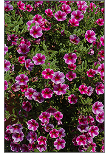
Can-Can Hot Pink Star Calibrachoa flowers

Can-Can Hot Pink Star Calibrachoa is recommended for the following landscape applications;