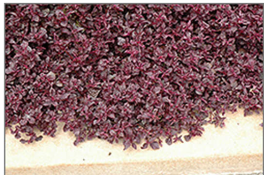
Purple Lady Blood Leaf