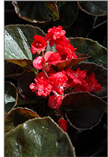
Doublet Red Begonia flowers

Doublet Red Begonia is recommended for the following landscape applications;