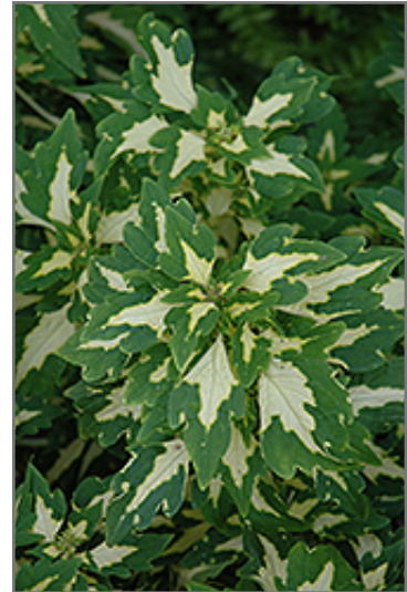
ColorBlaze Alligator Tears Coleus foliage