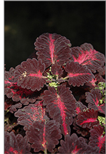
Black Dragon Coleus foliage