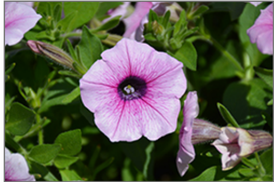
Shock Wave Pink Vein Petunia flowers