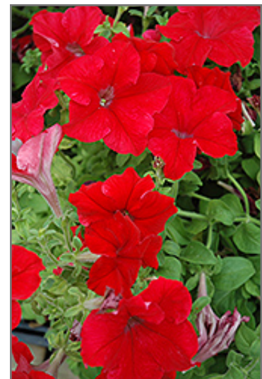
Dreams Red Petunia flowers