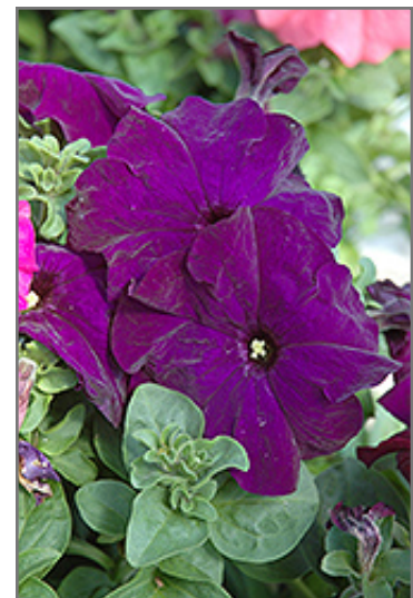
Dreams Midnight Petunia flowers