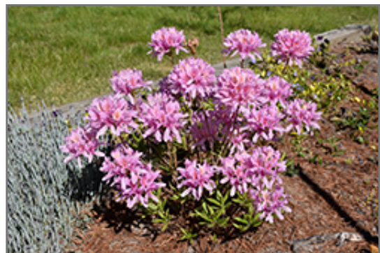
Orchid Lights Azalea in bloom