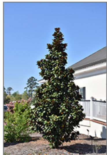
Teddy Bear Magnolia