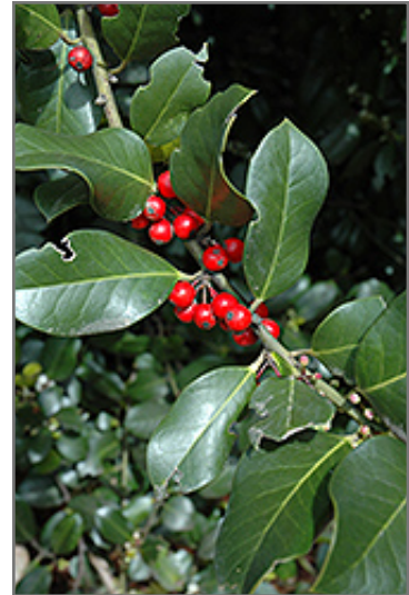
Hendersonii Holly fruit