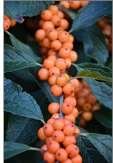
Winter Gold Winterberry fruit

Winter Gold Winterberry is recommended for the following landscape applications;