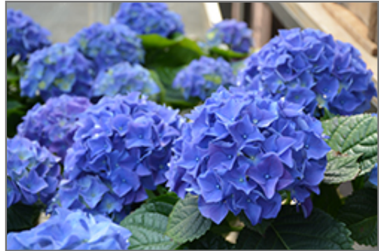
Early Blue Hydrangea flowers