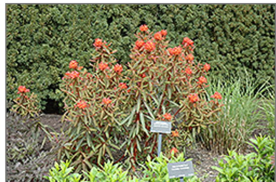
Dixter Spurge in bloom