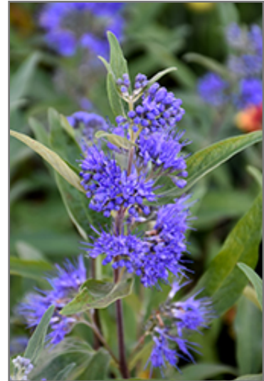
Sapphire Surf Caryopteris flowers