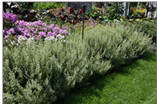
Montrose White Dwarf Calamint in bloom