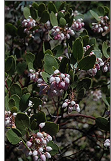
Common Manzanita flowers