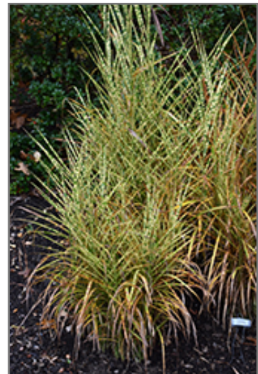
Gold Breeze Maiden Grass