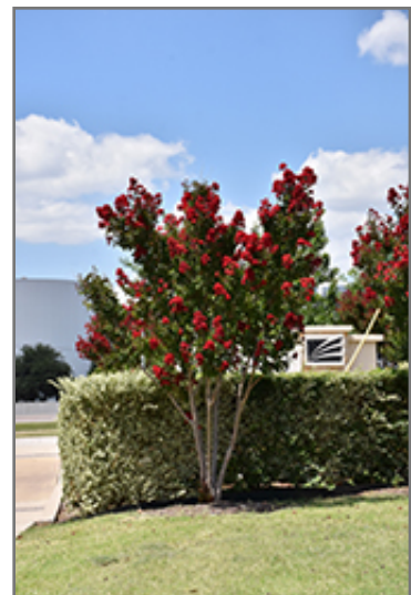
Dynamite Crapemyrtle in bloom