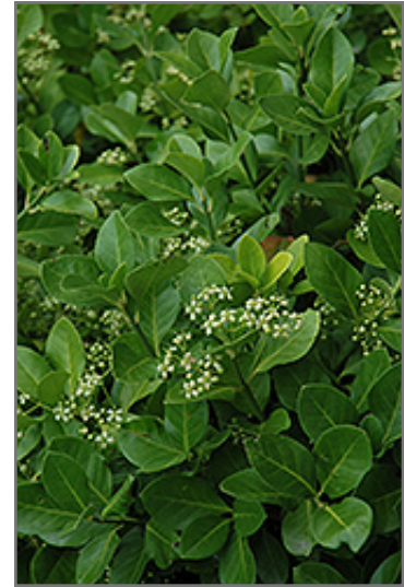
Manhattan Spreading Euonymus flowers

This shrub performs well in both full sun and full shade. It is very adaptable to both dry and moist locations, and should do just fine under average home landscape conditions. It is not particular as to soil type or pH. It is highly tolerant of urban pollution and will even thrive in inner city environments, and will benefit from being planted in a relatively sheltered location. This is a selected variety of a species not originally from North America.