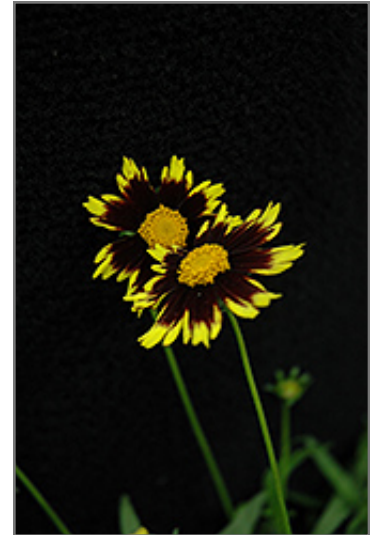
Cosmic Eye Tickseed flowers