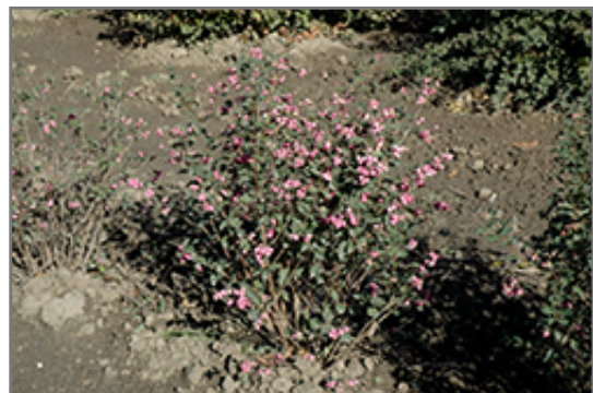
Sweet Snowberry