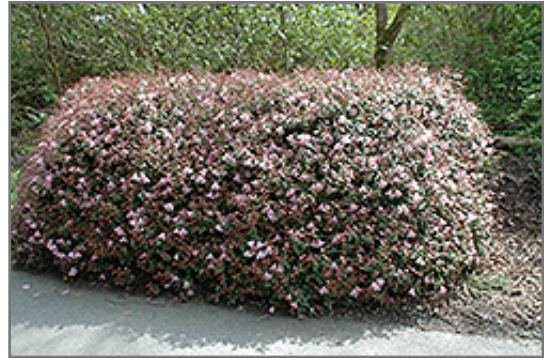
William's Rhododendron in bloom