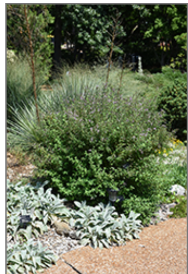
Leptodermis in bloom