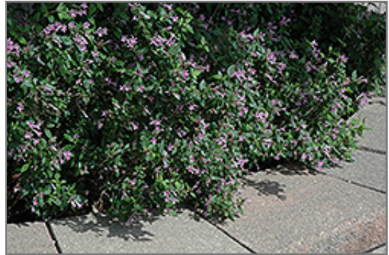
Leptodermis in bloom

This shrub does best in full sun to partial shade. It prefers to grow in average to moist conditions, and shouldn't be allowed to dry out. It is not particular as to soil type or pH. It is somewhat tolerant of urban pollution. This species is not originally from North America.