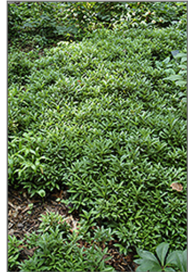
Dwarf Sweet Box