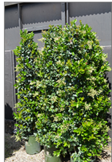
Texanum Japanese Privet (topiary form)