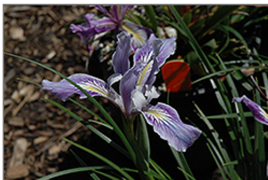
Golden Iris flowers