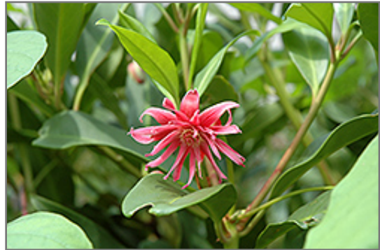
Woodland Ruby Anise Tree flowers

Woodland Ruby Anise Tree will grow to be about 7 feet tall at maturity, with a spread of 6 feet. It tends to fill out right to the ground and therefore doesn't necessarily require facer plants in front, and is suitable for planting under power lines. It grows at a medium rate, and under ideal conditions can be expected to live for approximately 20 years.