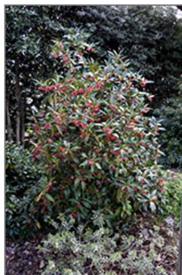
Woodland Ruby Anise Tree in bloom