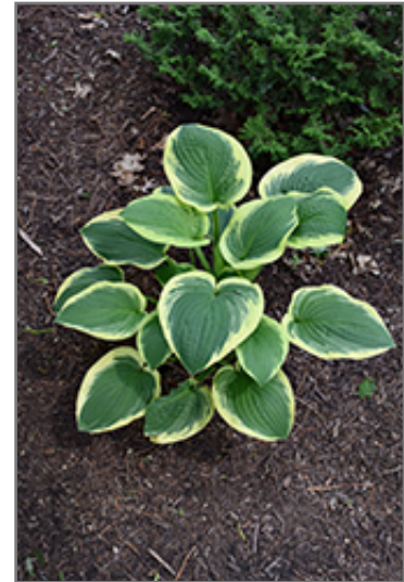
Formal Attire Hosta

Formal Attire Hosta is recommended for the following landscape applications;