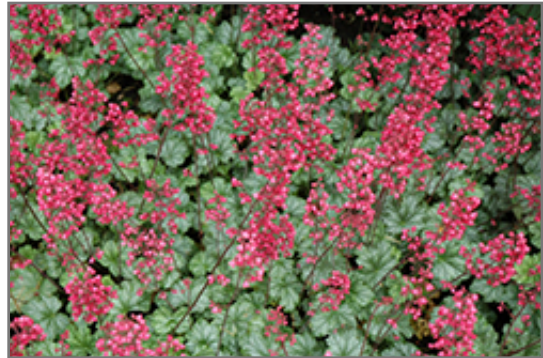
Paris Coral Bells in bloom

Paris Coral Bells will grow to be about 8 inches tall at maturity extending to 14 inches tall with the flowers, with a spread of 14 inches. When grown in masses or used as a bedding plant, individual plants should be spaced approximately 12 inches apart. Its foliage tends to remain low and dense right to the ground. It grows at a medium rate, and under ideal conditions can be expected to live for approximately 10 years. As an evergreen perennial, this plant will typically keep its form and foliage year-round.