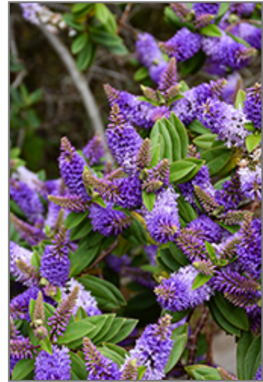
Autumn Glory Hebe flowers

This plant is not reliably hardy in our region, and certain restrictions may apply; contact the store for more information.