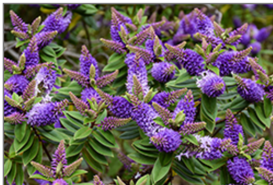
Autumn Glory Hebe flowers

Autumn Glory Hebe is recommended for the following landscape applications;