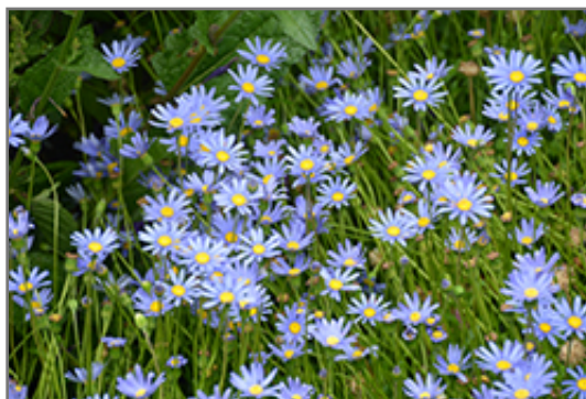
Blue Daisy flowers