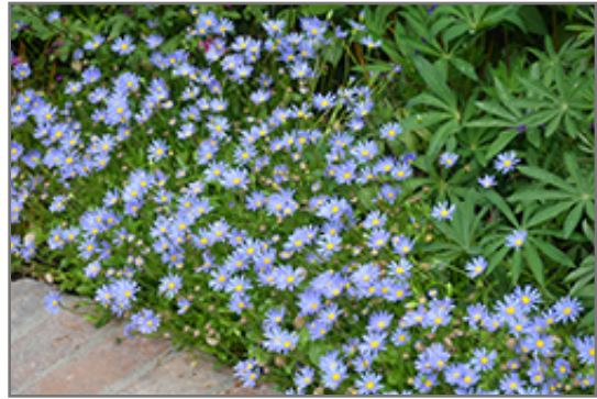
Blue Daisy in bloom

This plant should only be grown in full sunlight. It does best in average to evenly moist conditions, but will not tolerate standing water. It is not particular as to soil type or pH. It is somewhat tolerant of urban pollution. This species is not originally from North America.