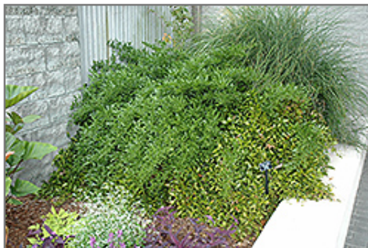
Alexandrian Laurel