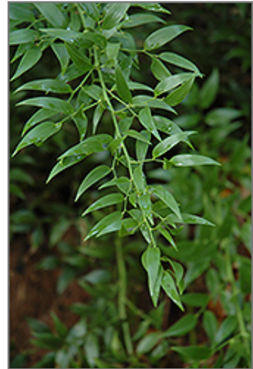
Alexandrian Laurel foliage

This plant is not reliably hardy in our region, and certain restrictions may apply; contact the store for more information.