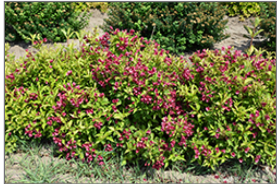
Ghost Weigela in bloom

This plant is not reliably hardy in our region, and certain restrictions may apply; contact the store for more information.