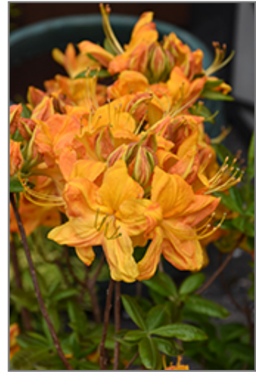
Klondyke Azalea flowers