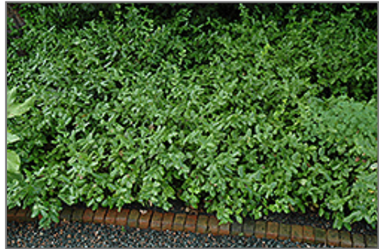
Sarcoxie Wintercreeper

This plant is not reliably hardy in our region, and certain restrictions may apply; contact the store for more information.