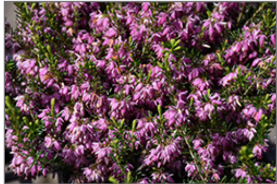
Springwood Pink Heath flowers

This plant is not reliably hardy in our region, and certain restrictions may apply; contact the store for more information.