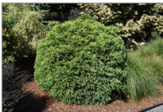
Dwarf Globe Japanese Cedar