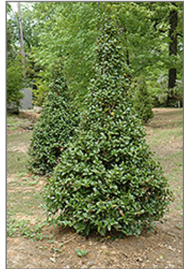
Castle Spire Meserve Holly