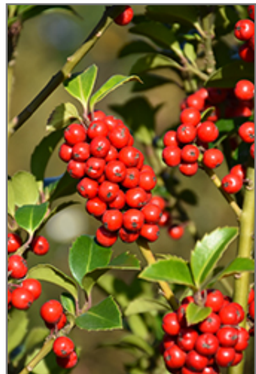
Castle Spire Meserve Holly fruit