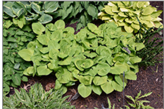
Vanilla Cream Hosta