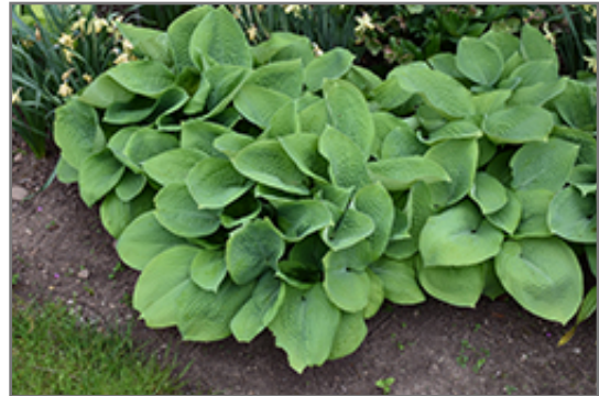
King Tut Hosta

King Tut Hosta is recommended for the following landscape applications;