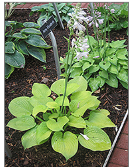
King Tut Hosta