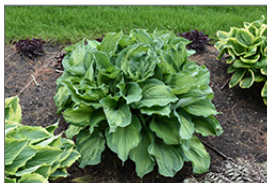
Guardian Angel Hosta