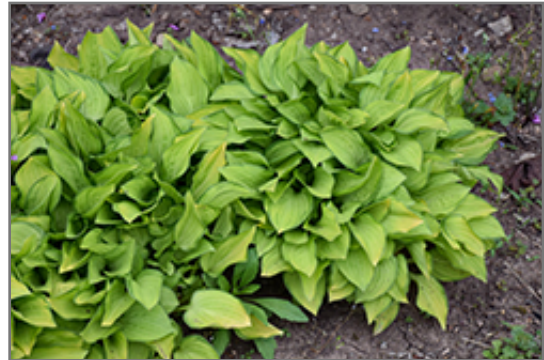
Emerald Tiara Hosta

Emerald Tiara Hosta is recommended for the following landscape applications;