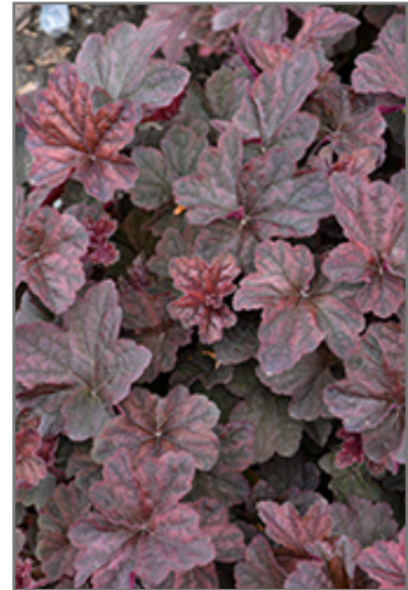
Mocha Coral Bells foliage

Mocha Coral Bells is recommended for the following landscape applications;