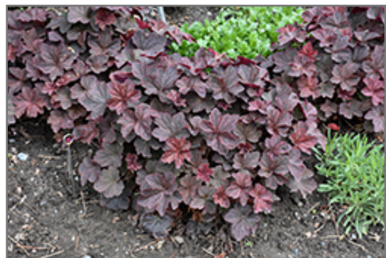
Mocha Coral Bells