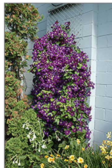
Jackmanii Superba Clematis in bloom