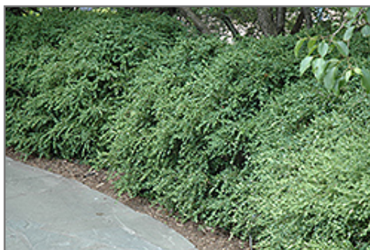
Wintergreen Boxwood