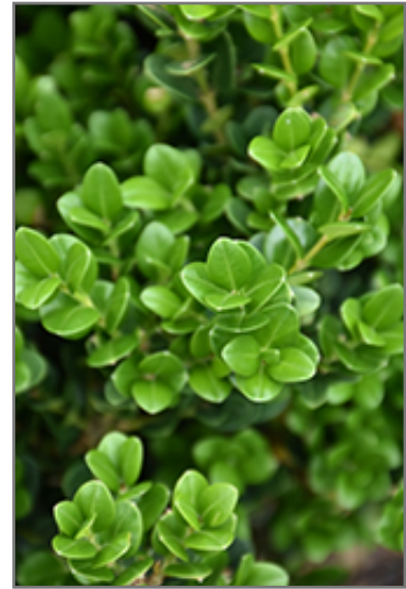
Wintergreen Boxwood foliage

This shrub does best in full sun to partial shade. You may want to keep it away from hot, dry locations that receive direct afternoon sun or which get reflected sunlight, such as against the south side of a white wall. It prefers to grow in average to moist conditions, and shouldn't be allowed to dry out. It is not particular as to soil type or pH. It is highly tolerant of urban pollution and will even thrive in inner city environments, and will benefit from being planted in a relatively sheltered location. This is a selected variety of a species not originally from North America.